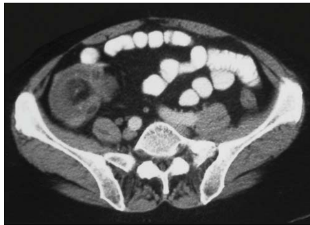
Figure 2. Abdominopelvic CT scan showed intramural, fat density mass in the ileum.

metastases have also been widely reported. Colonic lipoma as a leading cause is uncommon but is more often observed in females with a peak incidence between 50 and 60 years old (4). Most are found in the cecum, located submucosally (5). Several possible mechanisms have been suggested to explain this situation: (a) a tumor may act as a foreign body causing violent peristalsis, so that the contracted central part of the bowel easily moves into the dilated distal part; (b) intussusception may be due to the altered muscle function caused by a tumor or bowel paralysis; and (c) a tumor may be grasped and pulled forward by traction (6).