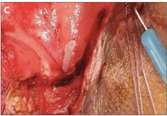
Figure 2. Parasacral/parasagittal approach (A) . Intraoperative view demonstrating parasacral exposure of the anorectum and the fistula (B) . Rectourethral fistula (C) .

imperforate anus. The symptoms (fecaluria and/or urine discharge from the anus) appeared after the operations performed for imperforated anus. In 2011, a colostomy was fashioned at another center for anal incontinence.