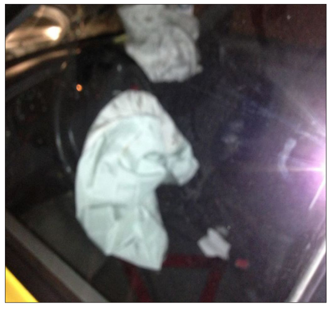
Fig. 1. The opened airbags in the car during the accident

vision. There was a tenderness on the right zygomatic arch with palpation. The other system examinations were normal. In laboratory tests were leukocyte count:9.24 thousand/uL, hemoglobin:15.9 g/dL, platelet count:266 thousand/uL. The routine biochemistry tests were within normal ranges. The brain, cervical and maxillofacial computed tomography (CT) were performed. The brain and cervical tomography were normal. The abdominal ultrasonography was normal. There were a thickness of subcutaneous soft tissue adjacent to right zygomatic arch and an increase in the density, but no fracture was observed in the maxillofacial CT (Fig. 2). Plastic surgeon suggested a symptomatic treatment for facial wounds. The patient was hospitalized to our emergency observation room for follow-up.