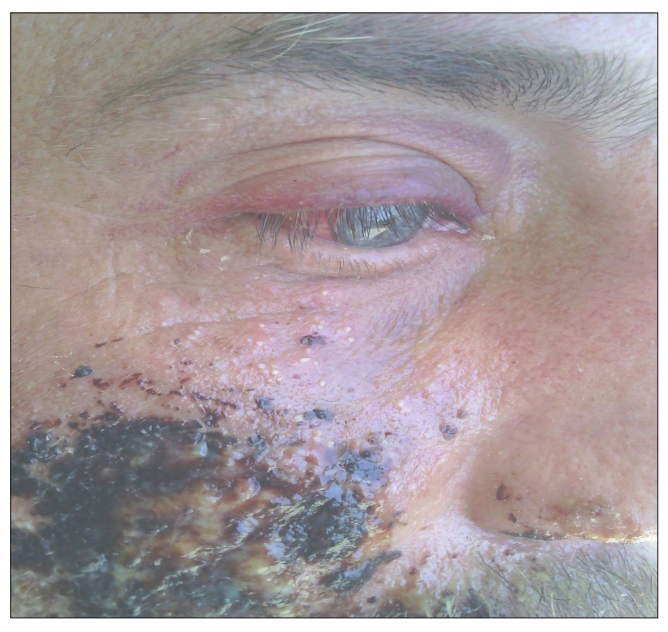
Fig. 3. Redness in the right eye, swelling in the right-lower eyelid of the patient

hemorrhage was detected. After the optometry, symptomatic treatment was suggested. After decreasing of complaints, the patient was discharged with suggestion ophthalmology and plastic surgery control on day two of follow-up.