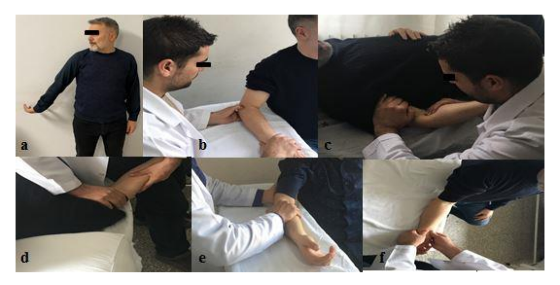
Figure 1. Mobilization techniques applied to patients; a: mobilization of radial nerve b: deep friction massage c: mobilization of the humeroulnar joint d: mobilization of the humeroradial joint e: mobilization of the proximal radioulnar joint f: mobilization of thedistal radioulnar joint.

Manual Therapy [MT] group: For the MT group, in conjunction with RNSM, MT techniques were applied two days a week for three weeks by the physiotherapist [SC], who was seven years of clinically experienced and was trained in manual therapy. Deep friction massage was applied to the extensor carpi radialis brevis muscle in transverse direction for 5 minutes, with the patient in a comfortable position on the bed, elbow flexed, and forearm in pronation. For joint mobilization, starting with cervical tractions, mobilizations were applied to the distal and proximal radio-ulnar and humero-ulnar joints at grade 1-2 intensity. Mobilization oscillations 1-2/sec., 5 sets and 20 sec each set. was in the form. [Figure 1b-f] [2, 7, 13].