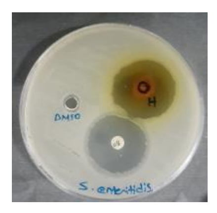
Figure 2. Well diffusion test. Susceptibility profile of H. plicatum extract on S. Enteritidis. CN: Gentamicin, H: H. plicatum extract