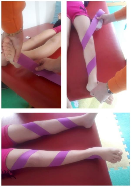
Figure-2. Distortion taping application using kinesio taping

Date: 02/03/2022). The study protocol was registered (ClinicalTrials.gov Identifier: "NCT05251519")."