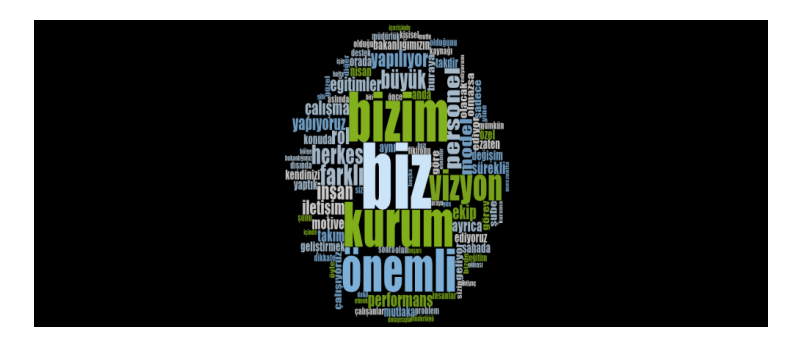
Figure 3. Word Cloud View of most frequently emphasized words

As seen in Figure 3, as a result of the word frequency analysis, it was determined that one of the most frequently emphasized words was "we" (biz) and the other was the word "our" (bizim)<sup>†</sup>. It can be stated that this result supports the transformational leadership characteristics of provincial managers to be a source of inspiration by including employees in the decision-making process and to develop team spirit by emphasizing the concept of "us".