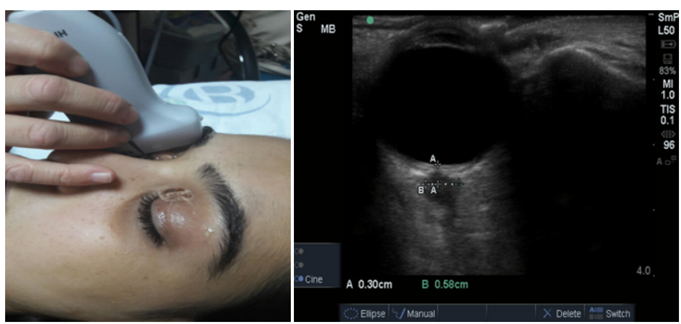
Figure 1. An application from the study