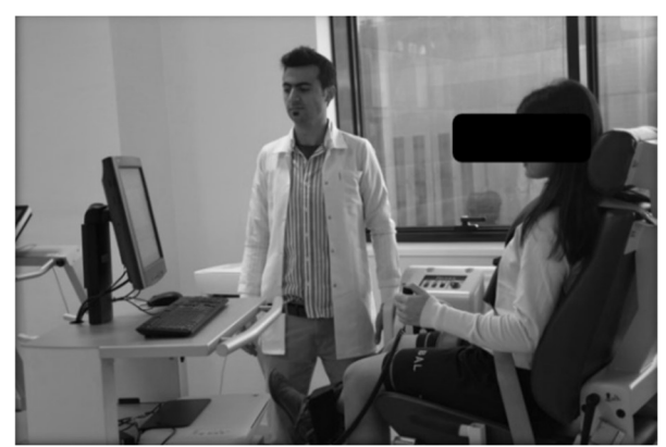
Figure 1. Assessing the proprioception level.