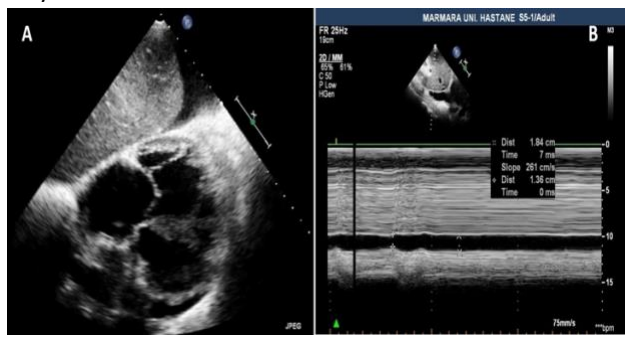
A: SXV, Dilatation of the right ventricle B: SXV and M-mode, VCI>2,1 cm, collapse <50%

the patients with an official CT report were obtained. The statistical significance of FOCUS parameters for PE was analyzed.