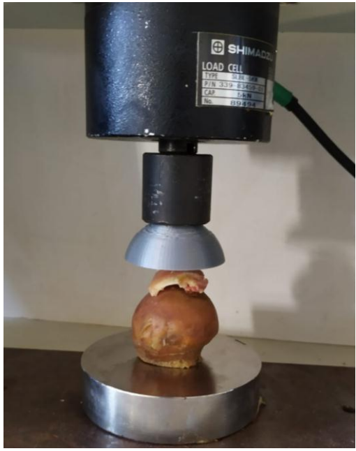
Figure 2. Biomechanical analysis of acetabular labrum specimens.

using a 3D printed set-up (Figure 2). The force (N) – elongation (mm) values were taken from a TRAPEZIUM X software and processed by Origin 8. The maximum stress (MPa) and strain values at 70 N loading was obtained with these programmes.