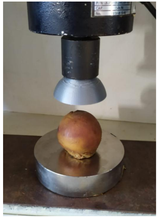
Figure 1. Compression testing set-up.