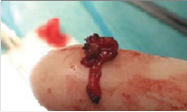
Figure 3. The fistula tract