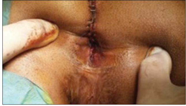
Figure 4. Postoperative view following reconstruction of the anorectum

Operative repair is the best treatment because conservative management with catheter drainage, bowel rest, and intravenous alimentation is usually ineffective (4,5). Some favorable results have been reported with the application of fibrin glue, endoscopic suturing, or fulguration of the fistulous tract, but reported experience is very limited (6). The surgical objectives in the management of the fistula are permanent separation of the urinary and fecal streams, prevention of urethral injury, and preservation of urinary and fecal continence.