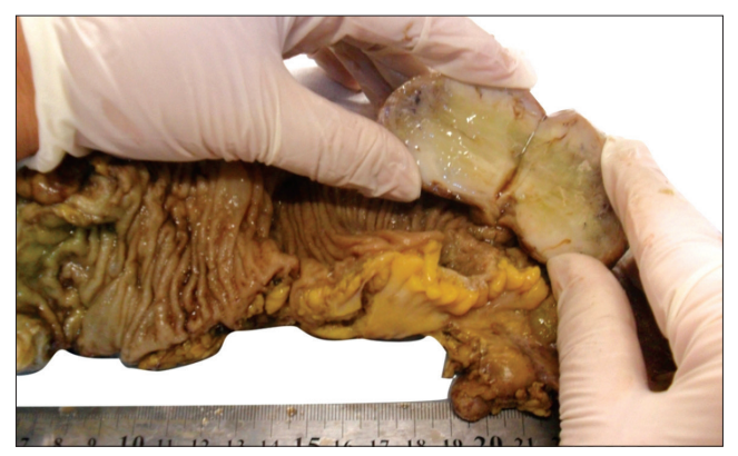
Figure 2. Macroscopic view of the resected spesmen with a 5.5x4.5x4 cm polypoid mass. A 55-mm pedunculated polyp in the ileum of the small intestine.