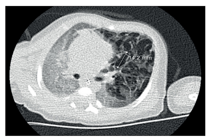
Figure 2. HRCT: Linear cystic features covering the left upper lobe of the lung and the entire middle lobe

directed to the PIA and the right selective intubation. A chest tube was attached to the patient whose left lung a pneumothorax was developed in again. It was decided to implement lobectomy on the patient and lobectomy was performed by the paediatric surgeon to the cystic areas in the upper left lobe of the lung. The patient who had no postoperative problems and whose histopathologic diagnosis was consistent with cystic adenomatous malformation type 3 in the postoperative period was discharged on the seventh postoperative day (Figure 3). Post-discharge controls showed that left lung tissue was well expansive (Figure 4). Informed consent was obtained from the family.