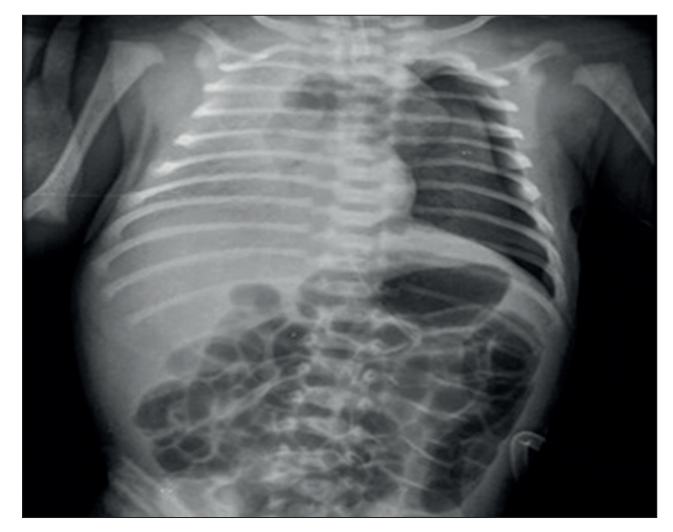
Figure 1. Chest X-ray