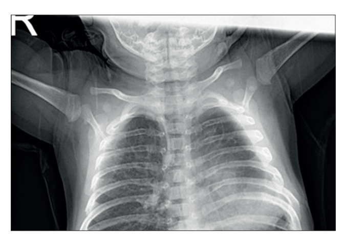
Figure 4. Post-discharge control chest x-ray

cells (3). Cases are seen in less than two years of age due to respiratory distress in the neonatal period or recurrent respiratory tract infections (4). Severe respiratory distress requires urgent surgical resection. There are five types of lesions. Type 0; acinar dysplasia or agenesis and most of them are incompatible with life. Type 1; is the most common type (50-65%), has the best prognosis. Macro-cystic and there is a single or several cysts larger than two centimetre (cm) covered with a ciliated pseudostratified (columnar) epithelium. The cyst wall has smooth muscle and elastic tissue, cartilage is rare. Survival is good. Type 2 has