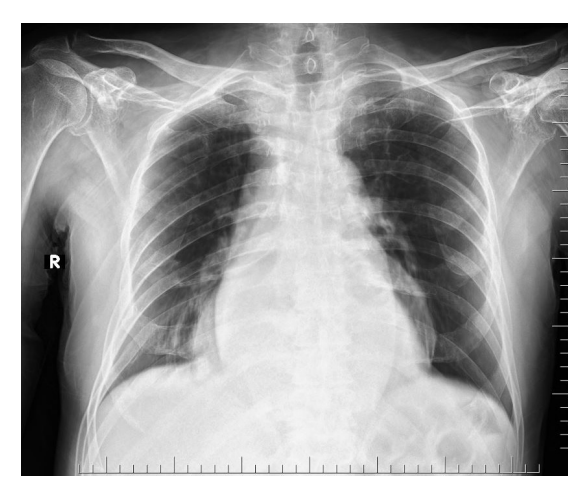
Figure 1. Chest X-ray showing bilateral double contour sign.

pressure was 110/70 mmHg, pulse 89 beats/min, temperature 37°C, and blood oxygen saturation 84% at room air. Lung sounds were decreased at the right lower zone. Leukocytes 4000/mm³, haemoglobin 8.6