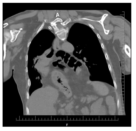
Figure 4. Multiplanar reconstruction of CT images demonstrating hiatal hernia.