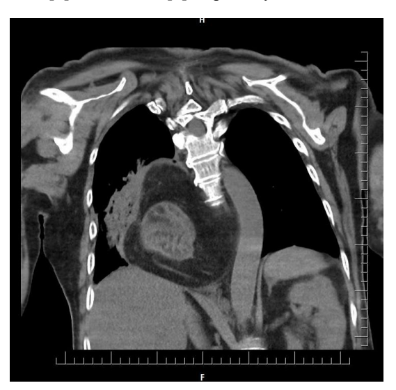
Figure 5. Chest CT-scan showing lung collapse due to intrathoracic stomach

It is necessary to perform chest X-ray in a patient admitted to emergency department with syncope. In the presence of double contour sign, syncope might be due to free-floating thrombus in the dilated left atrium by obstructing the mitral valve orifice [2]. The combination of double contour sign and syncope is one of the medical emergencies. Consequently, rapid differential diagnosis is important. Left atrial or ventricular compression due to enlarged giant hiatus hernia can cause syncope and bilateral double contour sign like our patient [3,4]. Intrathoracic stomach can cause acute heart failure [5] or cardiac arrest due to obstructive shock [6]. Our patient also had respiratory failure, but this condition was immediately resolved after the aspiration of mucus plug. On the other hand, giant paraoesophageal hernia (where more than half of the stomach is located in the mediastinum) can cause acute [7] or recurrent [8] respiratory failure.