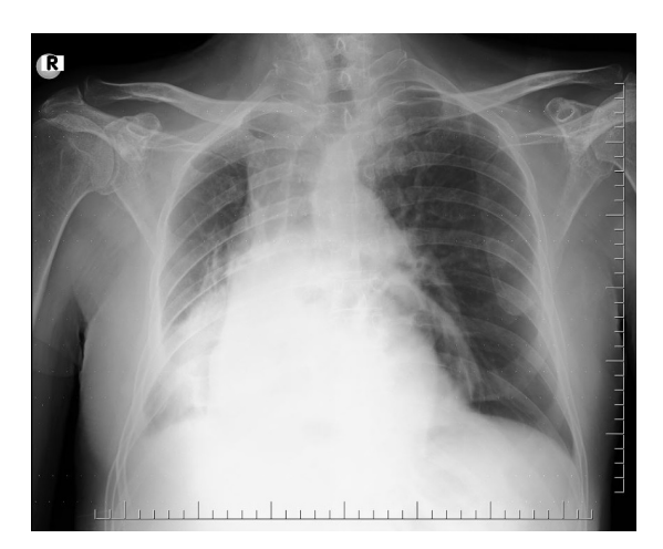
Figure 2. Chest radiograph demonstrating consolidation in right lower lobe associated with volume loss in ipsilateral hemithorax.

g/dL, CRP 5 mg/l, other peripheral blood and biochemical parameters were within normal range. Arterial blood gas analyses showed pH 7.54, PaCO2 43 mmHg, PaO<sub>2</sub> 50 mmHg, and HCO<sub>3</sub> 37 mmol/L. Chest X-ray demonstrated bilateral double contour on the cardiac borders (Figure 1). Chest X-ray repeated because dyspnea became progressively worse, and revealed a new opacity at right lower zone, and volume loss with ipsilateral shift of mediastinum (Figure 2). Chest CT-scan indicated a space-occupying tumor containing fat, air and soft tissue densities in posterior mediastinum and volume loss in right hemithorax (Figure 3). Mucus plug at right lower lobe bronchus was removed by fiberoptic bronchoscopy. Then, haemoglobin saturation was increased from 84% to 94% after bronchoscopy. Multiplanar reconstruction of CT images verified the diagnosis of diaphragmatic hernia (Figure 4), and lung collapse due to intrathoracic stomach (Figure 5). The patient had a long history of alcoholism. He showed significant improvement after administration of intravenous diazepam for delirium tremens. Although the patient did not undergo any surgical procedure, he was discharged by motivating to go a rehabilitation outpatient clinic for his alcohol use disorder.