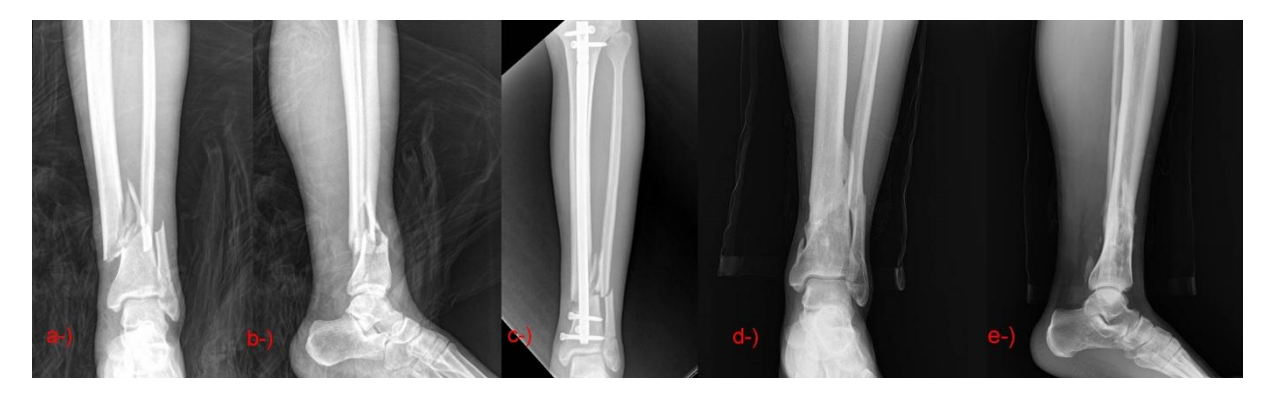
Figure 2: Thirty-one-year-old male AO/OTA type 43A3 a, b) Preoperative X-rays c) Early postoperative X-ray d,e)Postoperative X-ray at 34 th month, removal of the nail after fracture healing due to deep infection

infection ( Table 2 ). Infection regression was achieved through wound care and oral antibiotherapy in the patients with superficial infection. After fracture union was achieved by antibiotic pressure in the patients with deep infection, the intramedullary nails were removed. ( Figure 2 ). Anterior knee pain was detected in 15 (27.3%) patients postoperatively.