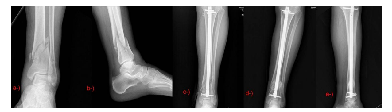
Figure 1: Seventy-year-old male AO/OTA type 43A3 a, b) Preoperative X-rays c) Early postoperative X-ray d, e) Postoperative X-ray at 19 th month

fractures. After the wound was observed as clean and available for surgery, permanent surgical treatment was implemented. The fracture of the fibula was assessed first during surgical approach. For fibula fractures considered as syndesmosis injury and instable, the fibula was fixated with a plate. IMN procedure was performed through a medial parapatellar approach while the knee was at flexion by 90° in all cases. The guidewire was observed on medial side of both anteroposterior and lateral planes to prevent malunion in the cases and intramedullay nailing was performed accordingly. Fractures with a sufficient distance on the distal side, 3 locking screws were inserted whereas 2 locking screws were inserted for the cases without sufficient distance. Polar screw was not inserted in none of the cases. The patients were not allowed to load for 6 weeks after the procedure. Then, they were allowed to load partially and complete loading on the leg was allowed after callus was observed in at least one cortex radiologically after 10 weeks ( Figure 1 ).