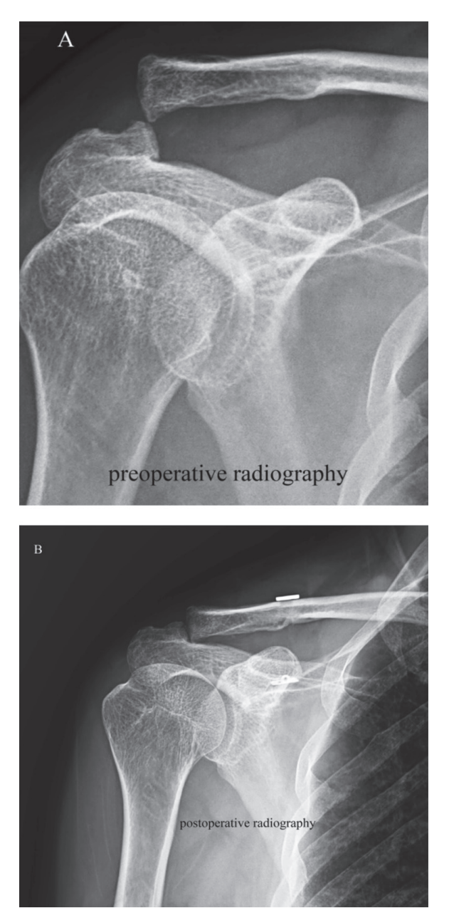
Figure 2. Endobutton technique (A) preoperative and (B) postoperative X-ray.

study in the literature has demonstrated any superiority of conservative treatment over surgical treatment.